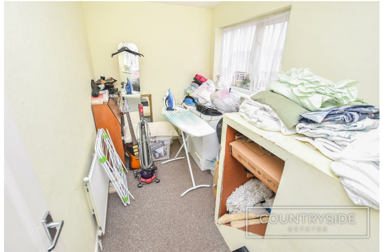
Bedroom Three 10'6 x 6'6 (3.20m x 1.98m)

Upvc double glazed window side aspect, carpet, artex ceiling, radiator and power points.