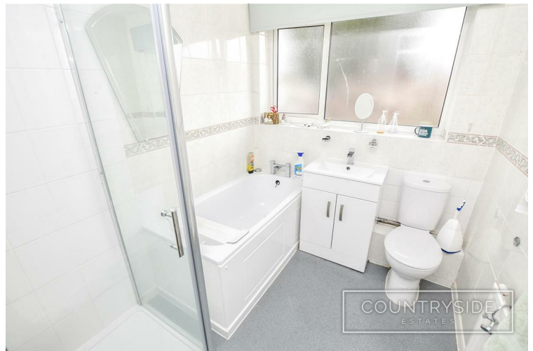
Bathroom 7'3 x 6'5 (2.21m x 1.96m)

Upvc double glazed obscure window to rear aspect, vinyl flooring, artex ceiling, fully tiled walls, white suite comprising, panelled bath with chrome mixer tap, large shower with glass door, vanity unit with inset handwash basin and chrome mixer tap, close coupled W.C, radiator.