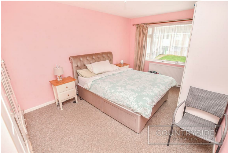
Bedroom One 14'9 x 10'2 (4.50m x 3.10m)

Upvc double glazed window to front aspect, carpet, artex ceiling, radiator and power points.