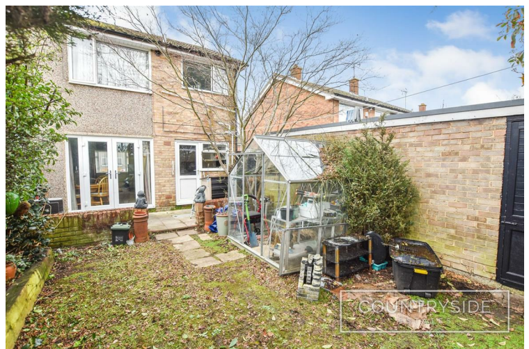
Rear Garden 33' x 19' (10.06m x 5.79m)

Commencing with patio, mostly laid to lawn with flowerbed borders, side access.